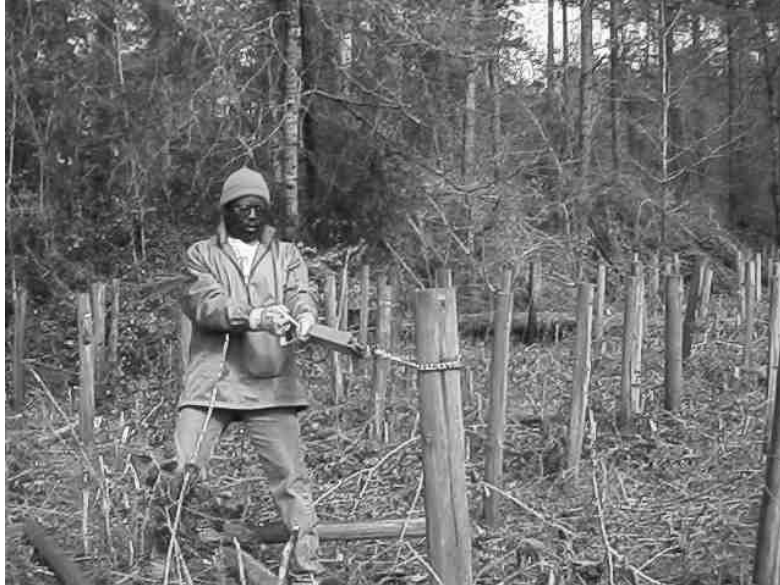
Example of 50 lb Pull test

The data from the evaluation was statistically analyzed using a variety of techniques (including assuming a Weibull lifetime distribution and calculating 90% confidence intervals at the 60 th percentile) and the results illustrate typical life spans for many of the preservative treated pine posts. The typical treated and untreated pine posts life span as approximated by the 60 th percentile can be seen in the Tables 2 and 3 and Figure 2.