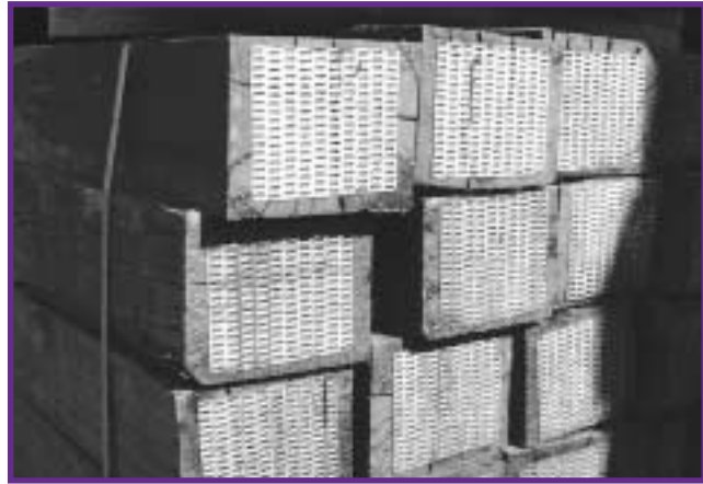
Creosote-treated wood products have been instrumental in the development of the U.S. railroad industry.

The high price of oil made the creosote process expensive, so an empty-cell process was developed by Max Rüping of Germany, and patented in 1902. This process utilizes an initial application of air pressure (usually 30 to 50 psig) before filling the cylinder and applying a higher pressure (usually 100 psig above the initial air pressure) to inject the preservative. After release of pressure, the excess preservative in the cell lumen is “kicked back,” resulting in a much lower retention than the conventional full-cell treatment. An extended steam flash and vacuum period applied after removal of preservative solution completes the process. This step reduces the amount of entrapped air and hence bleeding of preservative, yielding a much cleaner treatment. A second empty-cell treatment patented by C.B. Lowry