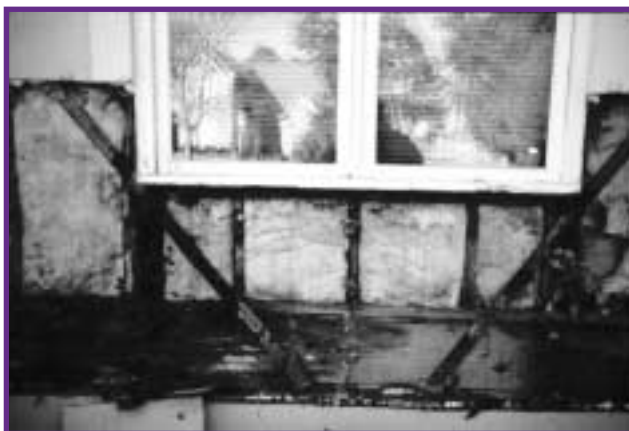
Mold and decay are the result of moisture that accumulated in this wall.

Mold growth in homes has not necessarily increased in recent years, but new court cases involving mold, sensationalistic media coverage, and publication of questionable scientific research have increased public awareness of the issue (Robbins and Morrell 2003). Much of the recent concern about mold was aroused after several articles on the subject appeared in scientific journals. One of the most widely publicized articles was written by researchers from the U.S. Centers for Disease Control (CDC). They reported that in 1993 there were 10 cases of acute pulmonary hemorrhage/hemosiderosis in infants, some of whom died, that was thought to be linked to the mold Stachybotrys chartarum (also known as Stachybotrys atra ) (Robbins and Morrell 2003). It was later determined there was no evidence or scientific proof that Stachybotrys caused the health problems in these infants (CDC 2000a). In fact, the CDC notes: "At present there is no test that proves an association between Stachybotrys chartarum ( Stachybotrys atra ) and particular health symptoms." (CDC 2000b) It appears as if good moisture control could solve most mold problems. The mold issue has only become a problem because the public now perceives it as a severe health threat, and attorneys are bringing the issue before juries to seek large judgments.