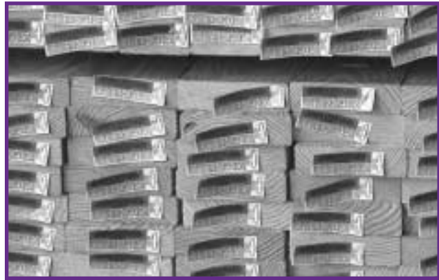
Treated lumber ready for shipment.

that treatment in the vapor phase could mitigate problems that occur when treating with liquids. All treatments in the liquid phase depend upon the movement of liquid preservative into the wood. Two problems must be overcome in order to get deep, uniform treatment. First, tension forces at the liquid-air and liquid-wood interfaces must be overcome. Secondly, transverse movement is dictated by the permeability of pit membranes. Gas phase treatment would seem to eliminate both of these major problems. The possibility of putting protectants into the cell wall using such an approach would mean that smaller amounts of biocides would be needed, thus further minimizing the impact on the environment. Gas-phase treatments have been used extensively for remedial treatment of wood in service (Morrell and Corden 1986, Morrell et al. 1986), but efforts to modify wood using gaseous reagents have met with only moderate success (McMillin 1963, Barnes et al. 1969). Reaction with alkylene oxides has yielded some decay and termite resistance (Rowell and Gutzmer 1975, Rowell et al. 1979).