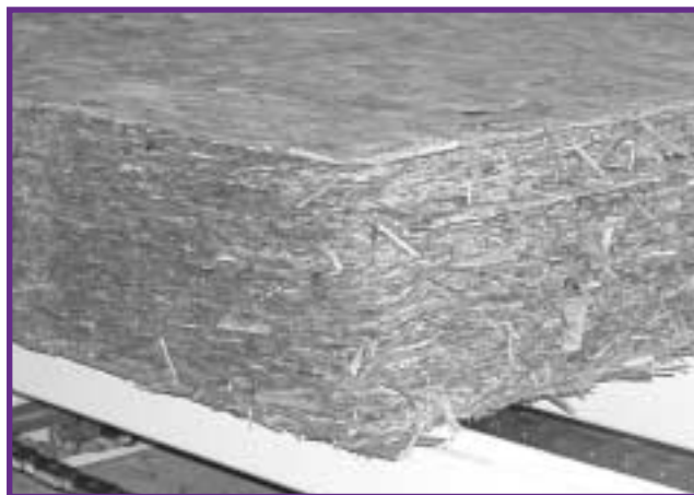
Oriented strandboard mat ready for pressing

The other major arsenical preservative, ammoniacal copper arsenate (ACA), was standardized in 1950. Known under the trade name Chemonite™, it was modified by replacing some of the arsenic with zinc in the 1980s; this formulation is known as ACZA. Because ACA and ACZA are alkaline and imbue the wood with vivid color, they have generally been used for industrial products and are used to treat refractory western conifers.