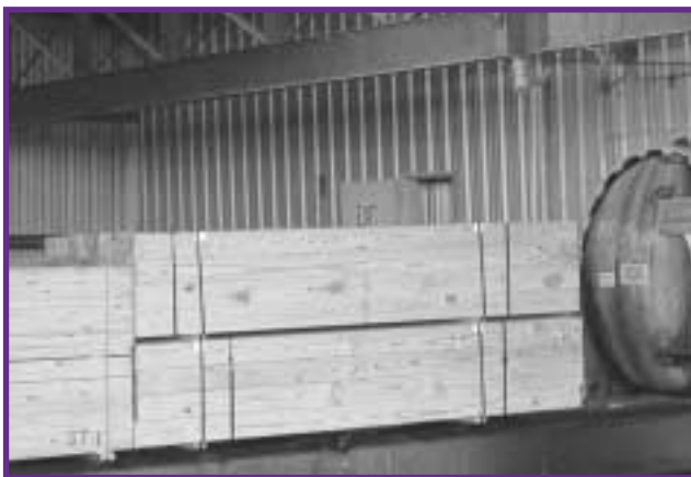
Southern yellow pine timbers being prepared for treatment.

One of the most exciting new treating technologies is based on the suggestion by Scheurch (1968)