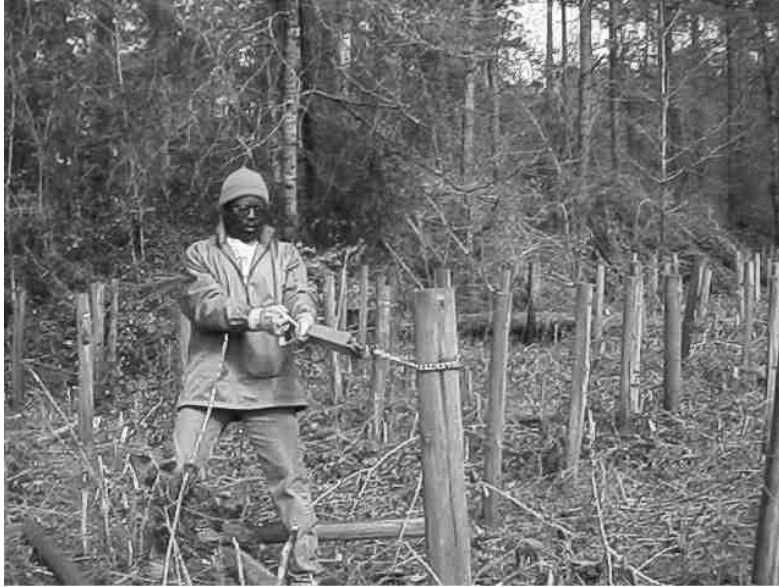
Example of 50 lb Pull test

The data from the evaluation was statistically analyzed using a variety of techniques (including assuming a Weibull lifetime distribution and calculating 90% confidence intervals at the 60 th percentile) and the results illustrate typical life spans for many of the preservative treated pine posts. The typical treated and untreated pine posts life span as approximated by the 60 th percentile can be seen in the Tables 2 and 3 and Figure 2.